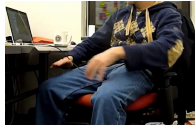
Figure 4. Ubiquitous Drums video on YouTube

We have not yet attempted a formal evaluation of Ubiquitous Drums. We have, however, received a large amount of positive feedback, both online (Figure 4) and in person (Figure 5).