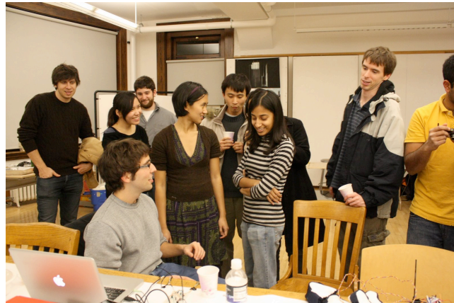
Figure 5. Making Things Interact final demos at CMU

Fundamentally, Ubiquitous Drums' success depends on whether or not people enjoy the interactive experience that it provides. Although our informal findings have been encouraging, we intend to conduct a thorough study to get a detailed profile of the system's prospective users. On one hand, we want to learn how long non-drummers interact with Ubiquitous Drums before losing interest. On the other hand, we want to investigate whether skilled drummers are able to play complex rhythms and get an acceptable response.