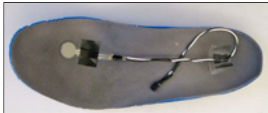
Figure 2. A FSR is attached to the sole of a shoe

Figure 3 shows the overall structure of the system.