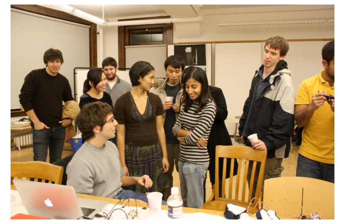
Figure 5. Making Things Interact final demos at CMU

Fundamentally, Ubiquitous Drums' success depends on whether or not people enjoy the interactive experience that it provides. Although our informal findings have been encouraging, we intend to conduct a thorough study to get a detailed profile of the system's prospective users. On one hand, we want to learn how long non-drummers interact with Ubiquitous Drums before losing interest. On the other hand, we want to investigate whether skilled drummers are able to play complex rhythms and get an acceptable response.